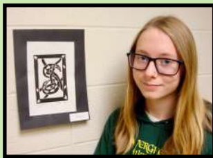
▲ Skvler Gomer, Illumination Print