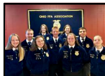
▲ 2019-2020 EHS FFA Officer Team