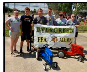
▲ Members volunteering at the FFA Alumni Pedal Pulls held throughout the community this summer