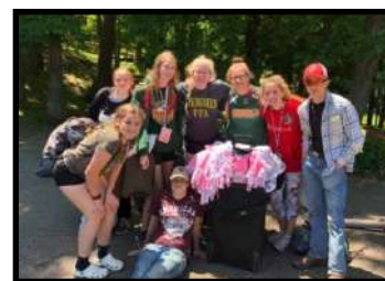
▲ Members at Ohio FFA Camp