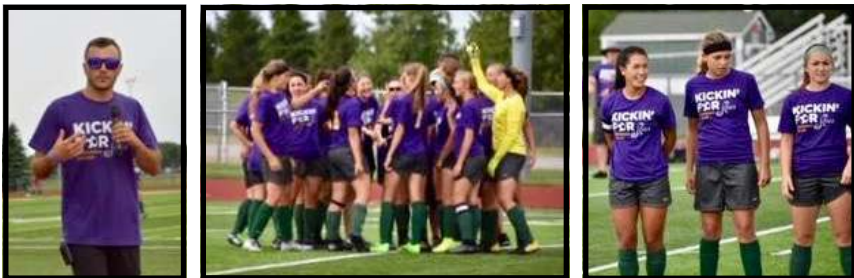
Photos from the girl's soccer game featuring KOGS