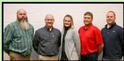
Pictured From Left to Right: