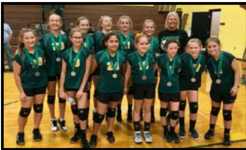
▲ EMS 7th Grade Volleyball Team

EMS recently hosted the JoeZ-MoJack Classic Volleyball Tournament. Seven teams competed in each of the 7th and 8th grade contests. Participating teams included Swanton, Fassett A & B, Otsego, Ottawa Hills, Fairview, and Evergreen. After a full day of competition, both the EMS 7th grade and 8th grade teams were awarded second place in the tournament. Congratulations!