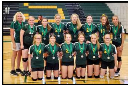
▲ EMS 8th Grade Volleyball Team